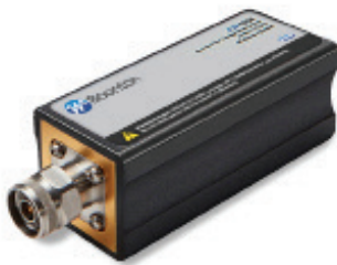
RTP4006 and RTP4106